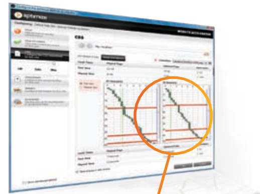
Simple user interface

See for yourself how the Optimize Website Accelerator increases the speed of your site, go to www.optimize.com/website-speed-test or email service@optimize.com .